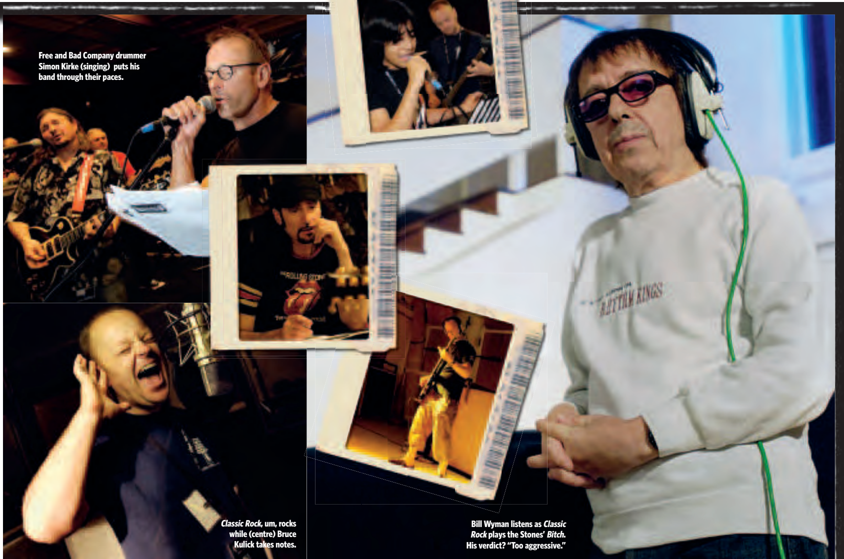
Free and Bad Company drummer Simon Kirke (singing) puts his band through their paces.