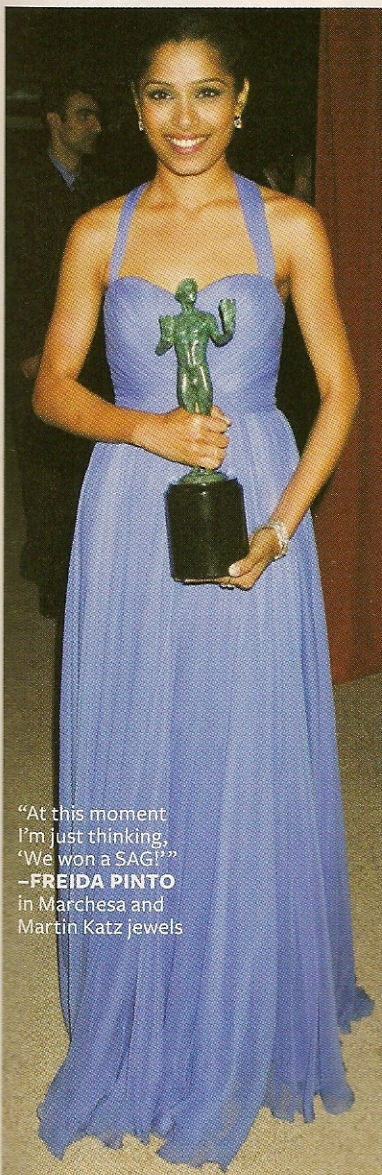
"At this moment I'm just thinking, 'We won a SAG!'" —FREIDA PINTO in Marchesa and Martin Katz jewels