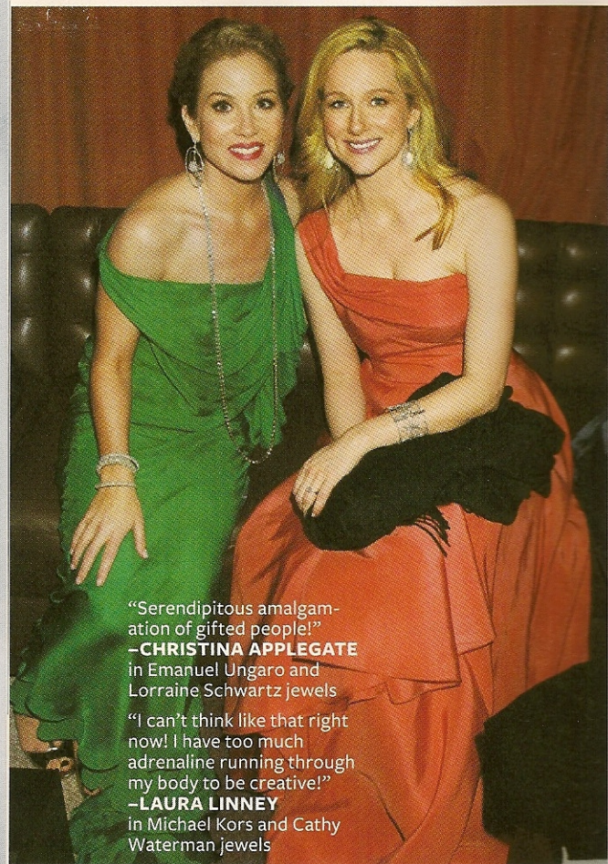
"Serendipitous amalgamation of gifted people!" —CHRISTINA APPELGATE in Emanuel Ungaro and Lorraine Schwartz jewels